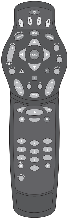
© 2003 US Electronics, LLC All rights reserved Part Number USE 18255, version 1.0 05202003

VISIT US ON THE WEB You can find programming instructions and codes for all of our remote controls, as well as information about our other products on our website: www.uselectronics.com